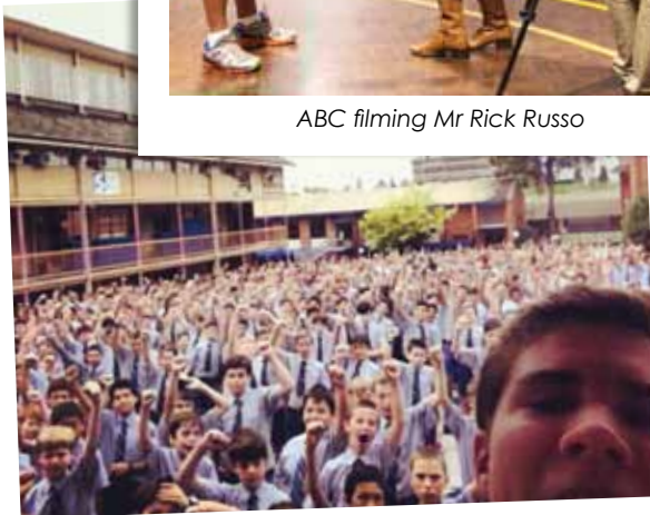
Anti-bullying and Harmony day "selfie"