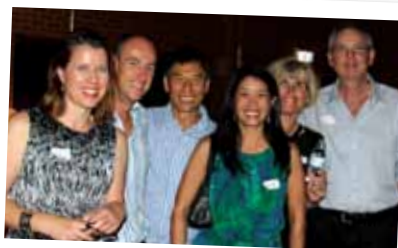
A record 300 parents attended the memorable P&F Cocktail Party thanks to the efforts of the P&F.