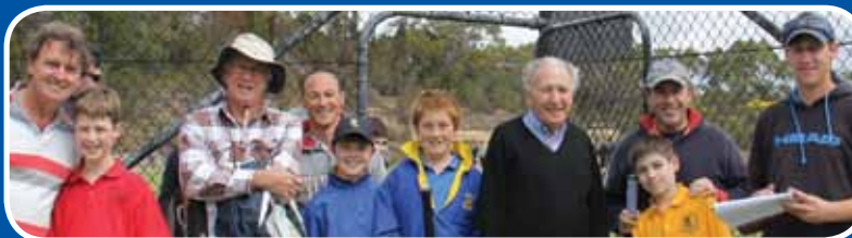
The highly competitive father/son sports day at Oxford Falls.

The College was in action early for the Fathers' Day breakfast. Dads and their sons enjoyed live music, espresso coffee, bacon and egg rolls, muffins and juice.