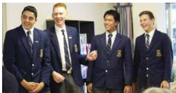
Year 11 students at Willowood

Willowood residents enjoy singing along to all their favourites including the "Hokey Pokey", "You Are My Sunshine", "The Two of Us" and "Auld Lang Syne".