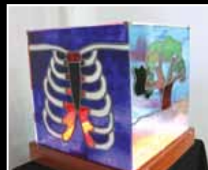
CONOR APCAR • A WELL LED LIFE IN LEAD