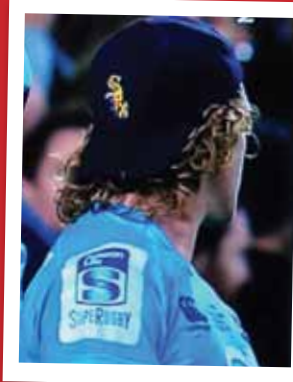
Michael wore a SPX cap for his victory lap after captaining the Waratahs to Super 15 victory.

Michael became a Wallaby last season, was named Wallabies Vice-Captain and then rewarded for his outstanding play and leadership by being named Wallabies Captain. He is the youngest captain since 1961 and has accrued 33 caps to date.