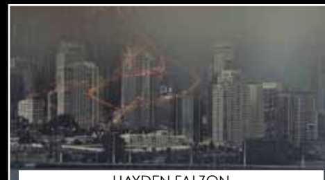
HAYDEN FALZON • EMBERS OF IMAGINATION (FILM)