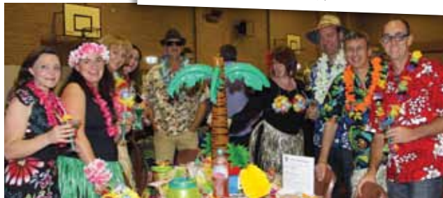
Trivia Night - a great fundraiser with $25,000 raised to support College clubs.