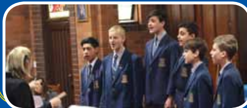
A beautiful rendition of "Unwritten" by our Vocal Ensemble.

The College held two beautiful gatherings to honour all our mothers and grandmothers. More than 150 mothers and families gathered in the Sarto Centre for a Liturgy before muffins and morning tea. Then the Junior School Mothers Mass was held - a very moving occasion.