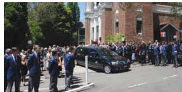
The guard of honour by St Pius boys