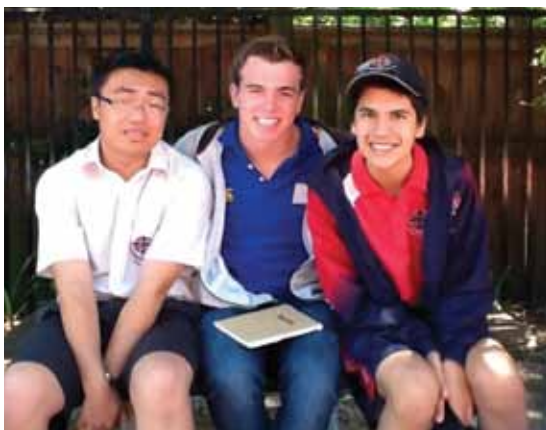
St Edmund's, Wahroonga

St Joseph's College, Geelong is our brother EREA school in Victoria.