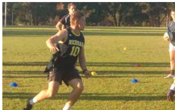
The 1st XV training with Michael Hooper