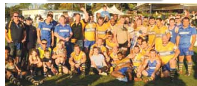
Barraclough Cup Champions 2013 – Brothers 34 defeated Forest 10