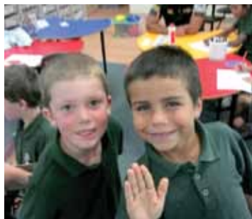
St Mary's Primary, Bowraville