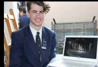
Nicholas Montague's film, Afterlight