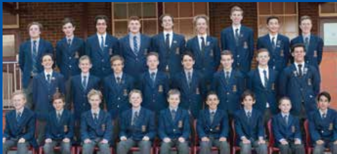
Sons of Old Boys (2015)