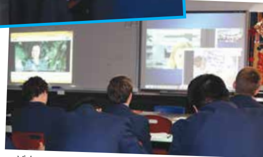
Videoconference with the Australian Botanic Garden