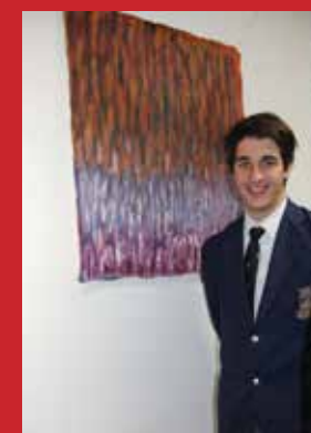
Isaac Rayner's drawing, Stripped Emotions