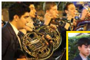
The Orchestra playing at the Twilight Concert in August. The new orchestral bass drum thanks to the generosity of PAPA.

Orchestra's repertoire ranges from Dvorak to Gaga! The Orchestra is currently looking to strengthen its membership with oboe and bassoon players.