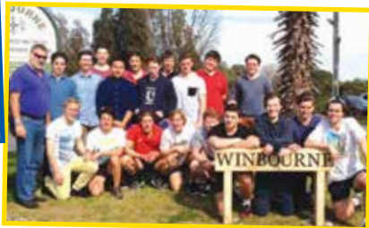
Year 11 Prefects Camp