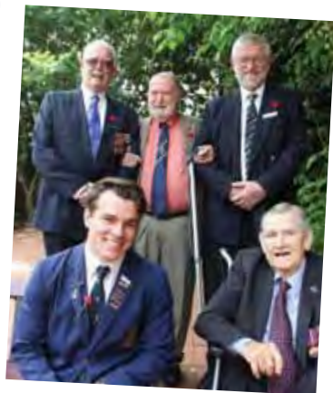
SPX Old Boy veterans

Year 10 and 11 students supported the Poppy Appeal by selling poppies around Chatswood Station to raise funds to support the work of the NSW RSL and Delegate RSL in particular.