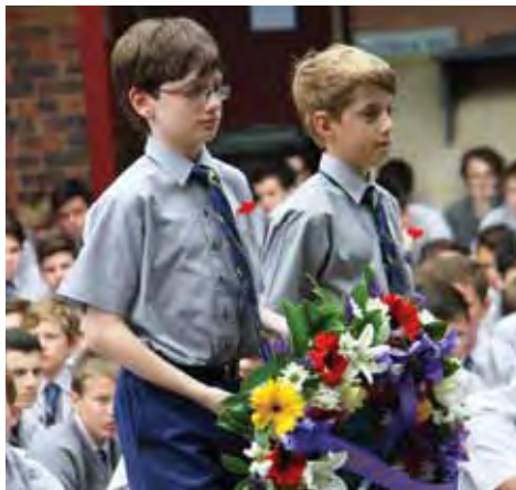
Laying of the Wreath