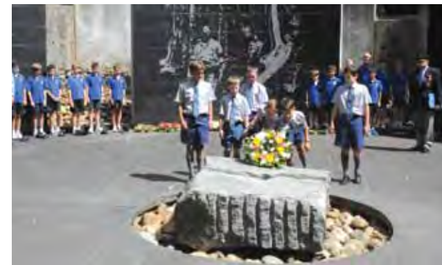
Year 5 Excursion to the Kokoda Memorial