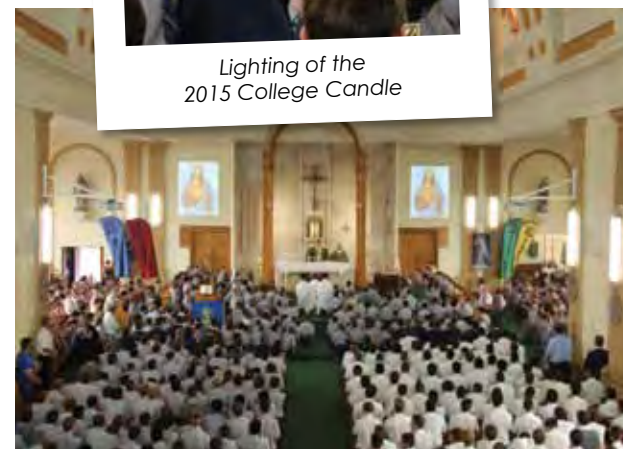
More than 1,250 students, staff and special guests at the 2015 Commencement Mass