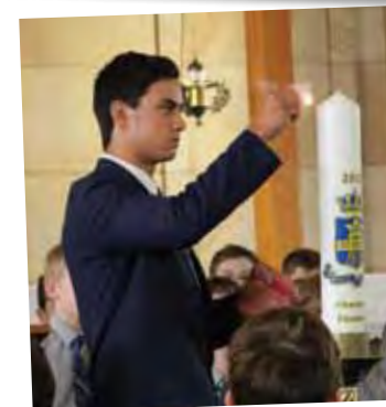
Lighting of the 2015 College Candle