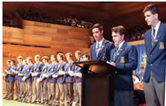
Year 12 Investiture Pledge