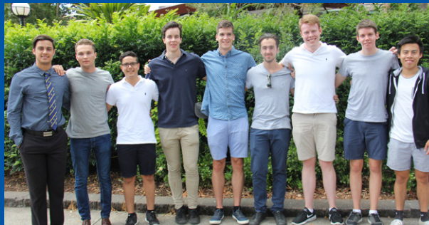
ATARs over 95