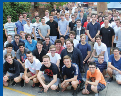
Class of 2015 celebrating their HSC results